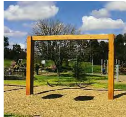
Timber frame swing