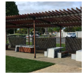
Timber shelter, amenities block + train station