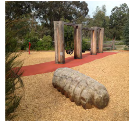
Feature timber elements