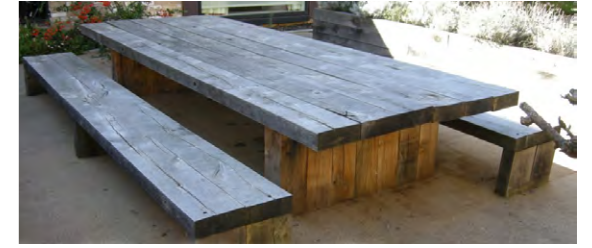
Long tables with bench seating