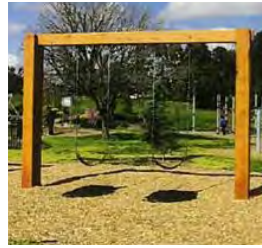
Timber frame swing + feature elements