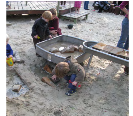
Sand and water play combined