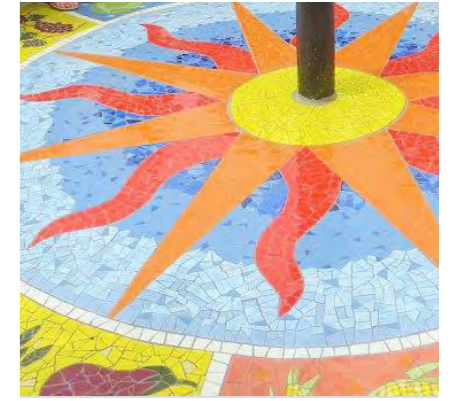
Feature colour elements