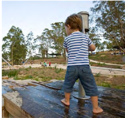
Water play pump