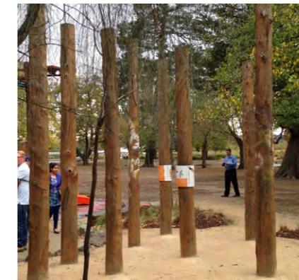
Timber pole forest