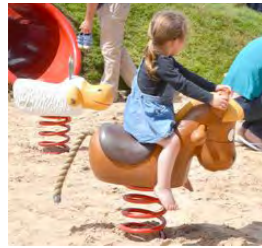
Bespoke toddler springer