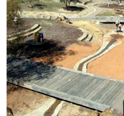
Low bridge over paved swale