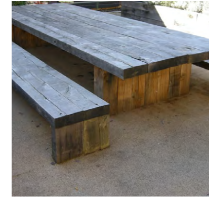
Long tables with bench seating