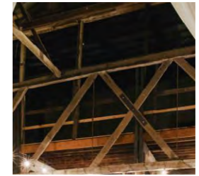
Local precedents of desired timber aesthetic Chunky timber construction