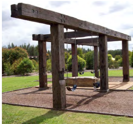
Timber frame swing