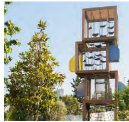
Customised bespoke play tower + bridge