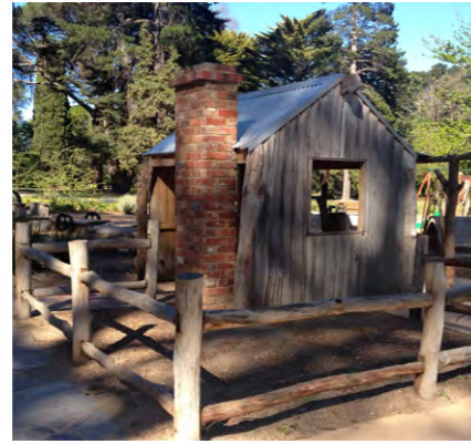
Play cubby + chimney