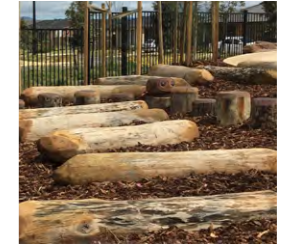
Local timber logs