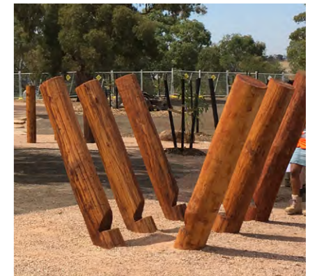
Timber pole play elements