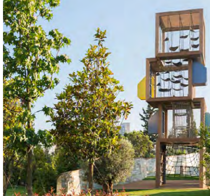
Custom bespoke play tower