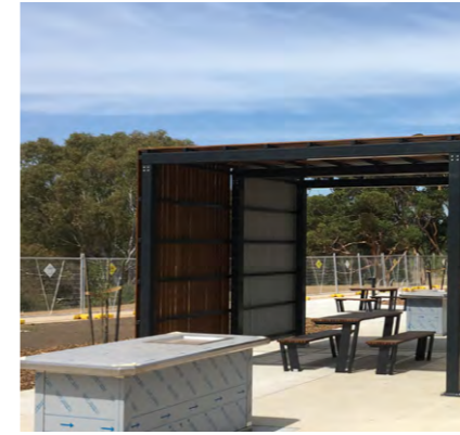
Timber + steel shelter + bbq