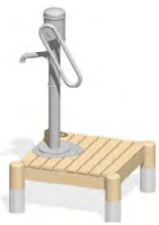
Water play: pump and river stone paved swale