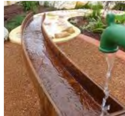
Water play pump and channel