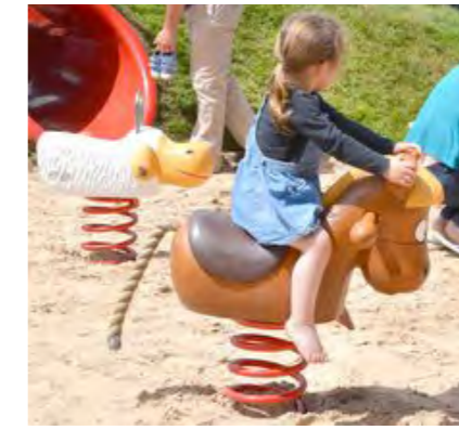
Bespoke toddler springer