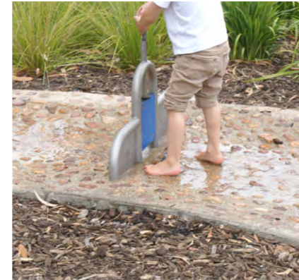
Water weir over river stone swale