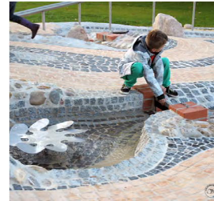
Water weir and paved swale