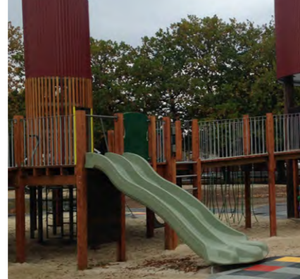
Play tower using natural timbers