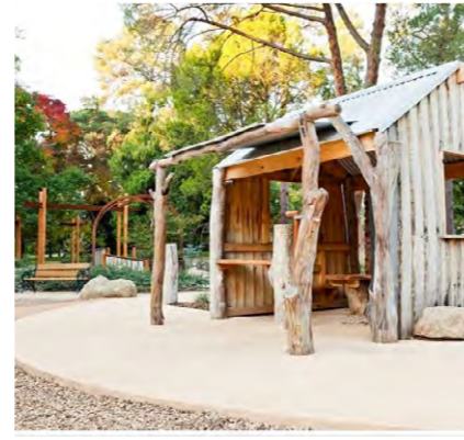
Play cubby + verandah