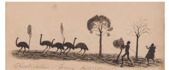
Consider collaboration with local Elders, and artists in the design of bespoke elements