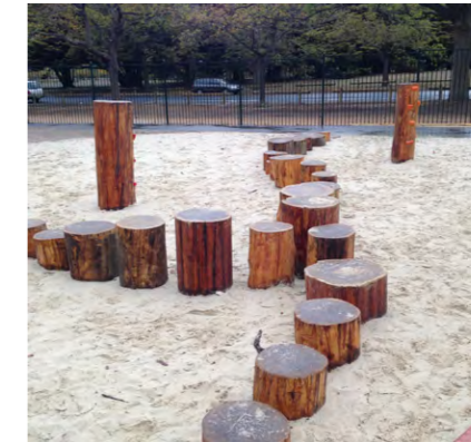
Sand play with balance logs