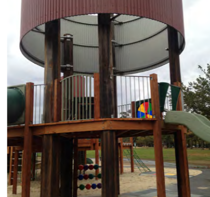
Play tower + slide + colour + climbing