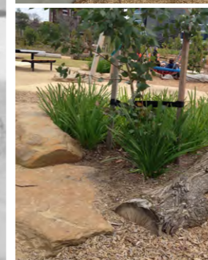
Examples of feature rocks and planting integrated into play space