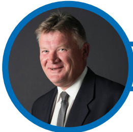
Mayor Cr Patrick Bourke