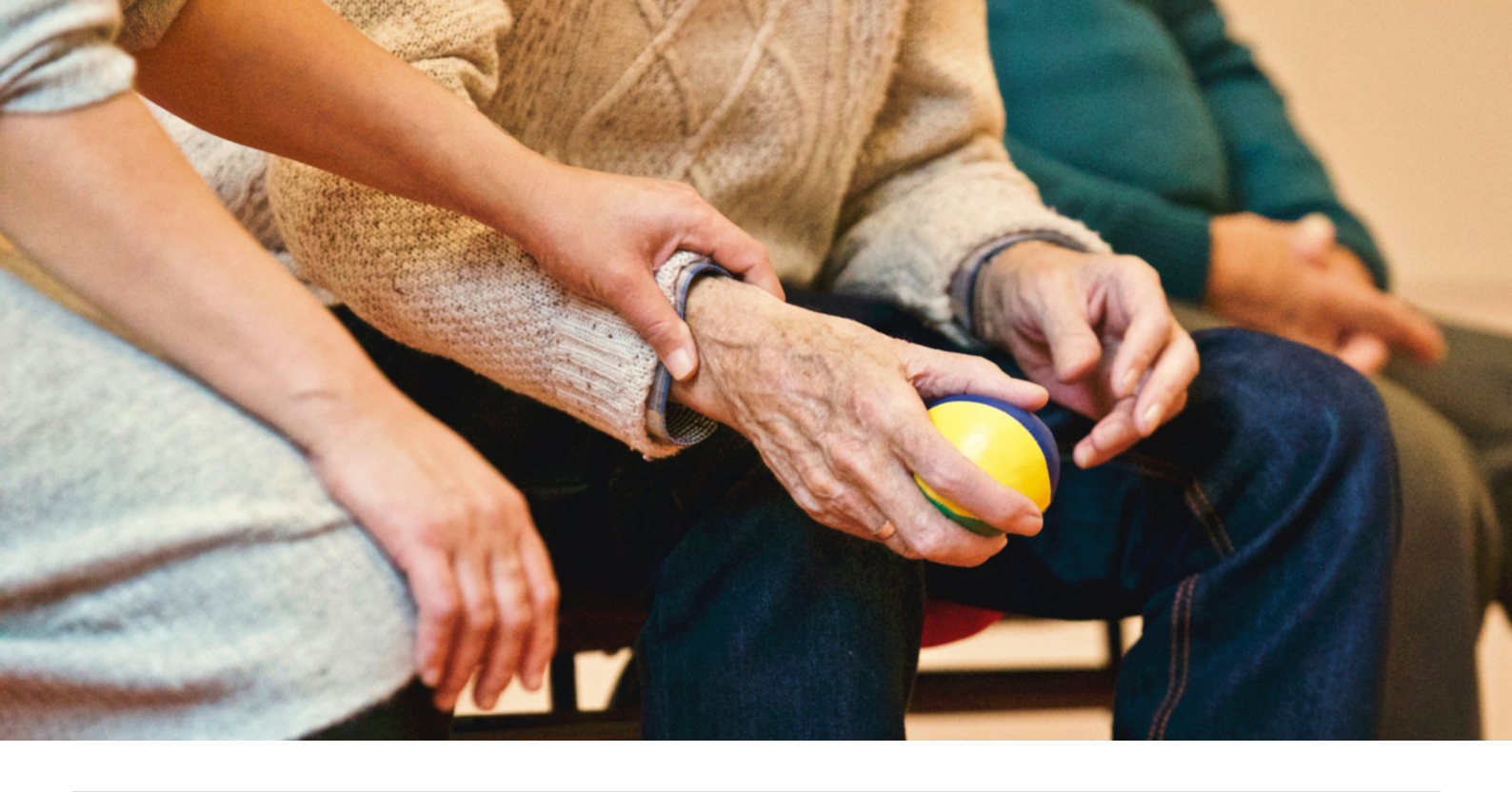
Objective 10: Advocate from access to medical, allied health and disability services for people across the Federation Council area.