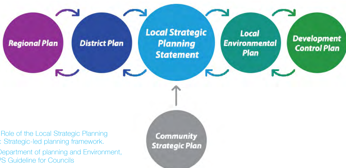
Figure 1: Role of the Local Strategic Planning Statement: Strategic-led planning framework.

Monitoring and reporting of the LSPS will be undertaken through the local government Integrated Planning and Reporting Framework.