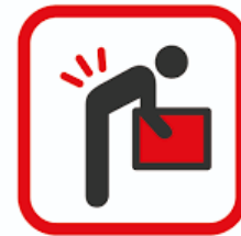
Manual Handling / Lifting