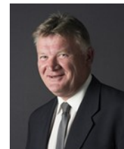
Mayor Patrick Bourke